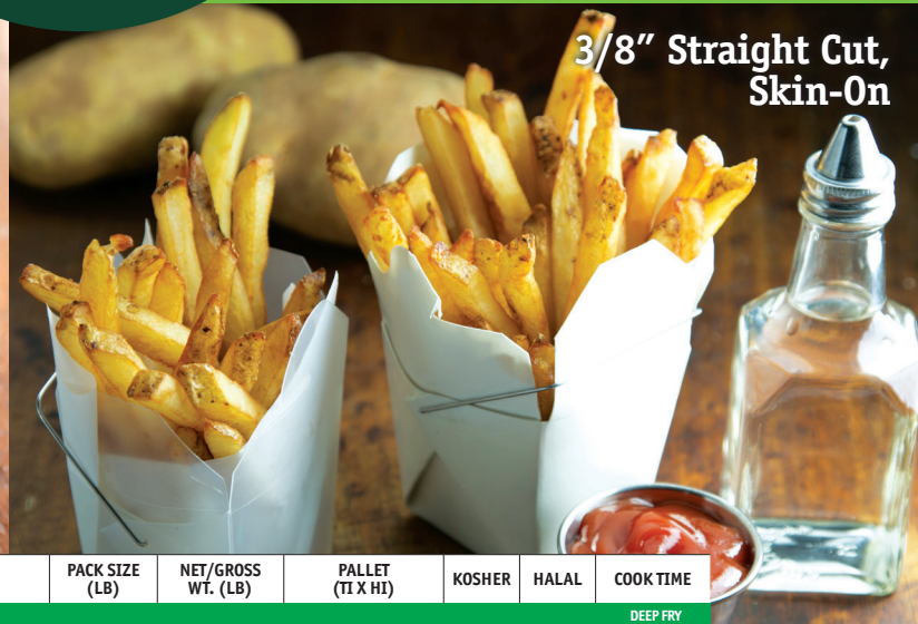
3/8" Straight Cut, Skin-On